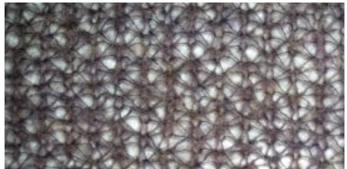
Card 2 – Alternate Needle Tuck Stitch

Note It is worth considering whether to join the pieces with the surfaces matched or reversed. If there is any contrast between the faces of each piece, the appearance of the garment will be affected by your choice.